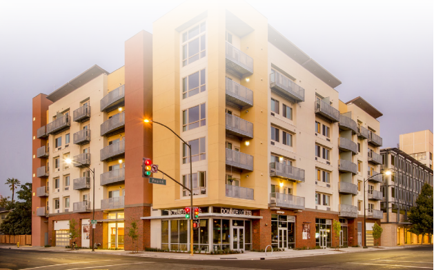
MidPen Housing Corporation's Donner Lofts in Downtown San José

Now that nexus studies are completed, SV@Home will work with Santa Clara, Saratoga, Milpitas, Santa Clara County, and Campbell to adopt progressive, yet feasible residential and non-residential Housing Impact Fees. Additionally, we will work to protect San José's residential HIF from new efforts to reduce its effectiveness, and advocate for the City to study a Commercial Linkage Fee.